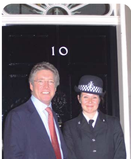
Phil with local PC at Number 10 Downing Street

Although crime is relatively low and falling locally I will continue to press the police to respond rapidly to specific problems when they arise.