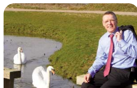
Phil at Stanwick Lakes

Locally I was pleased that the Landfill Communities Fund gave £24,475 to enhance the woodlands at Glapthorn, Short Wood and Southwick Wood to protect rare species including butterflies.