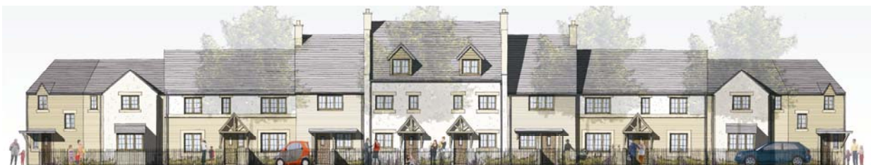
Artist's impression of proposed housing on Lincoln Way

I am also pleased that affordable housing for Corby people is a significant part of the development schemes in Oakley Vale and Priors Hall.